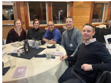
Powell Banz Valuation, LLC staff and guests