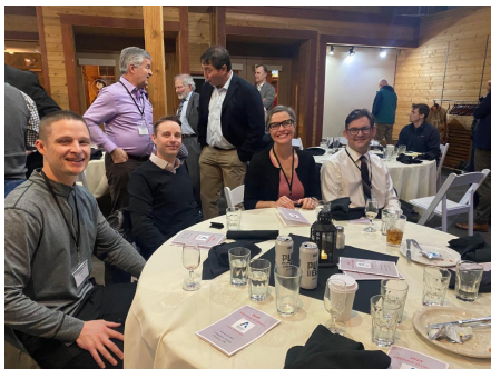
Powell Banz Valuation, LLC staff and guests